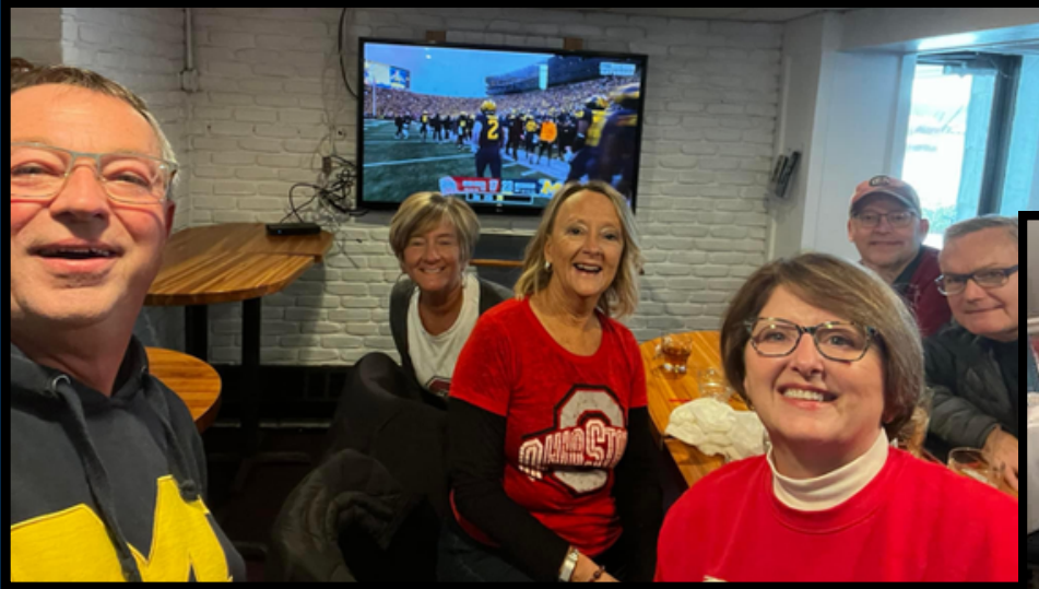
OSU/MI Game in the Tap Room