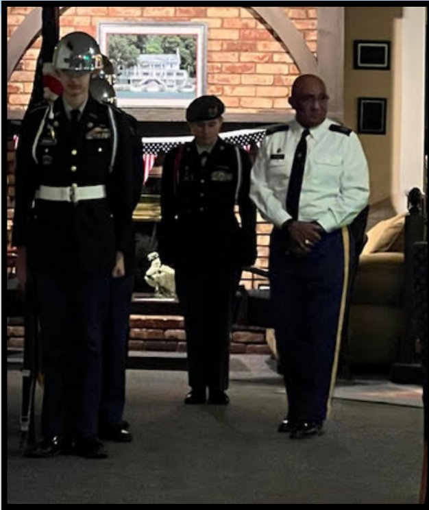
Springfield JROTC at MRYC Veteran's Day Celebration