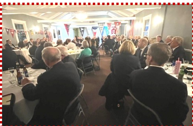
The ballroom with 90 people for a recent AYC dinner event!